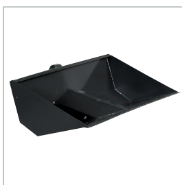
■ Tipping shovel