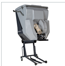
■ Grass collector