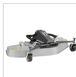
■ Rotary/mulch mower 1500