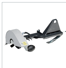
■ Lawn edger