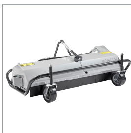
■ Flail mower