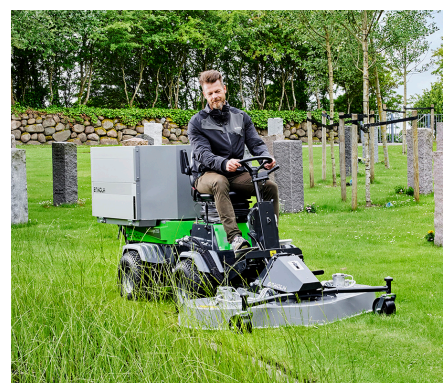
Rotary/mulch mower 1500