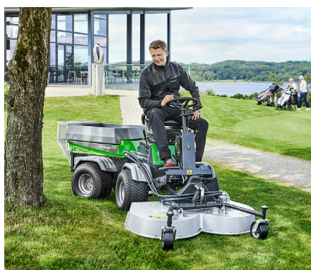
Rotary/mulch mower 1200