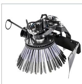
■ Weed brush