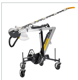
■ Hedge cutter