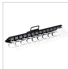
■ Environmental rake