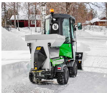
Salt and sand spreader