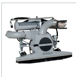
■ Leaf suction unit