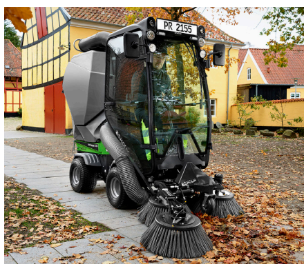
Suction sweeper with 3rd side brush