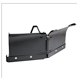
□ Snow V-plough