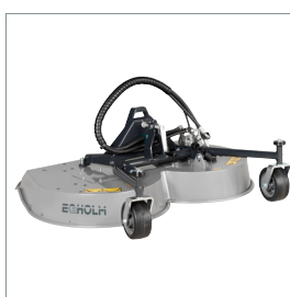
■ Rotary/mulch mower 1200