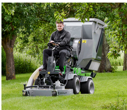
Rotary/mulch mower 1000 with grass collector