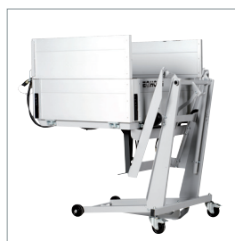
■ Load carrier with tip