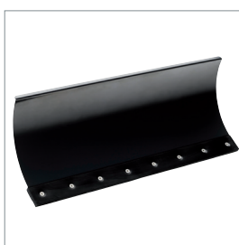
□ Snow plough