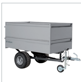
■ Tipper trailer