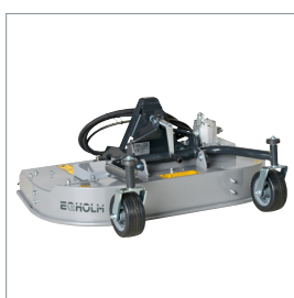
■ Rotary, mulch or collection mower 1000