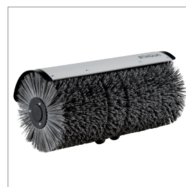
□ Snow sweeper