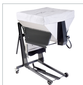
□ Salt and sand spreader