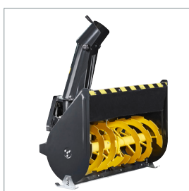
□ Snow blower